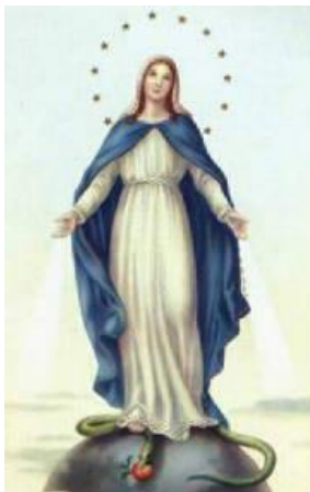
Our Lady of Grace

The Hesperides are nymphs who live in a beautiful garden, situated in the Arcadian Mountains (Greece) or, alternatively, at the western extreme of the Mediterranean, near Mt. Atlas (hence they are sometimes considered daughters of Atlas ). In this garden grows the tree with the golden apples which Gaia had given as a present to Hera on her wedding to Zeus . This garden is guarded by Ladon , a dragon with a hundred heads. Ladon lay coiled around the tree of immortality (just as the serpent points to that tree in the Garden of Eden). The only one who succeeded in obtaining some of the apples was Heracles , who tricked Atlas to get them for him and who killed Ladon, whom Hera made into the constellation Draconis (Draco). The Hesperides are Aegle, Arethusa, Erytheia and Hesperia. They are also called The African Sisters.