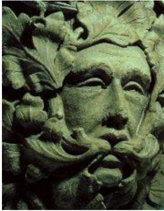
Green Man "speaking" in hawthorn leaves Parish Church in Sutton Benger, UK Hauntingly wise (c.1300)

"The force that through the green fuse drives the flower drives my green age."